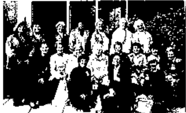
AAW's delegation to Australia in 1994