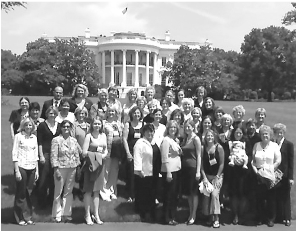
AAW members posed for a group photo following the White House garden tour.