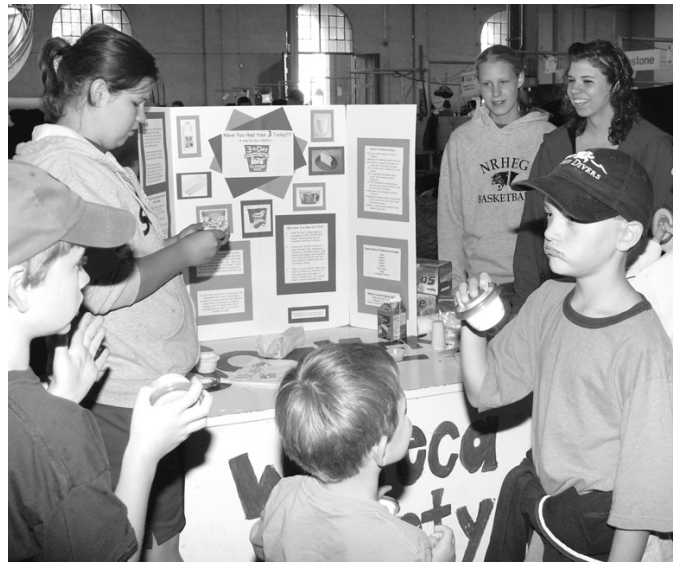
Butter making, a fun hands-on activity led by 4-H members from Waseca County, Minnesota.

His first priorities are ethics, civil rights and reviewing all pending rules and regulations from the outgoing Bush administration. Vilsack stressed "the most important thing for us to do right now is to have a complete and thorough understanding of the Farm Bill as it was drafted by Congress and to make sure that we implement the provisions of the Farm Bills as promptly and properly as possible. There are "600 provisions and 15 titles that