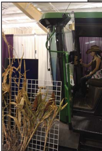
Driving the Combine