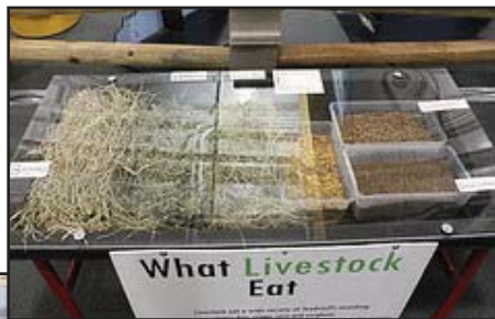
Connecting 'feed' to 'food' for children and families