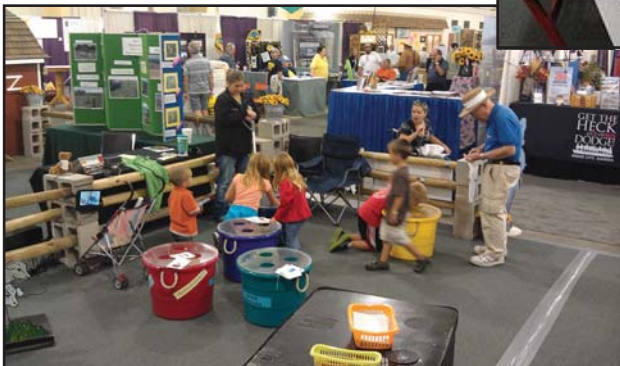
Children getting thier hands into the grain tubs, identifying products made from commodities, and sharing their new knowledge with their parents.