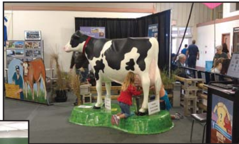
Children Milking 'Blossom'